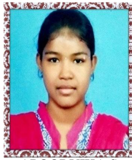
APOORVIKA.S SIX PHARSE,FRIENDZION