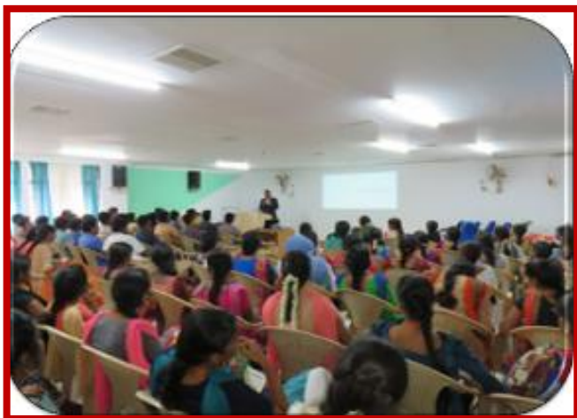
Guest lecture on “Agile Methodolgy “ on 22.02.2019