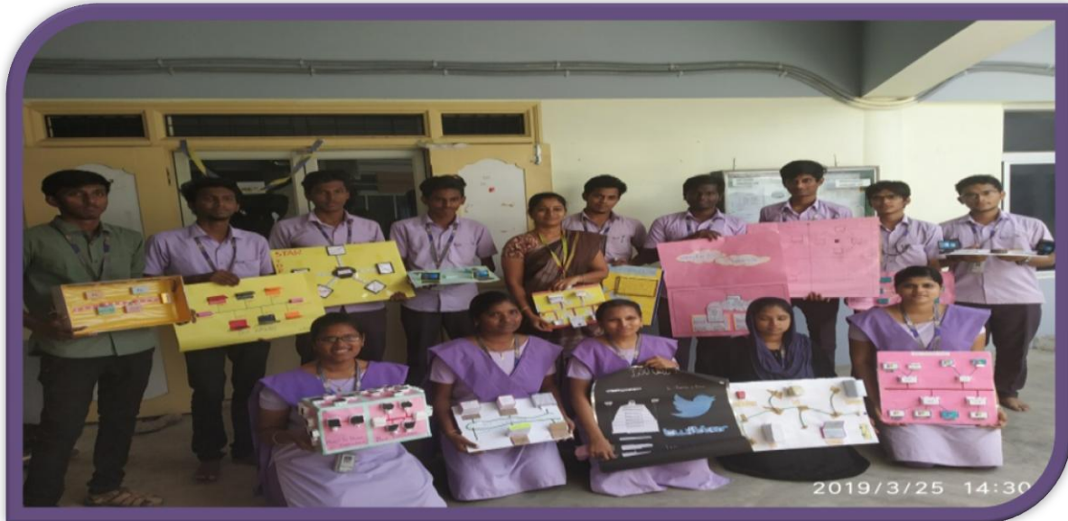
MODEL DESIGNED FOR CN BY 2nd YEAR STUDENTS