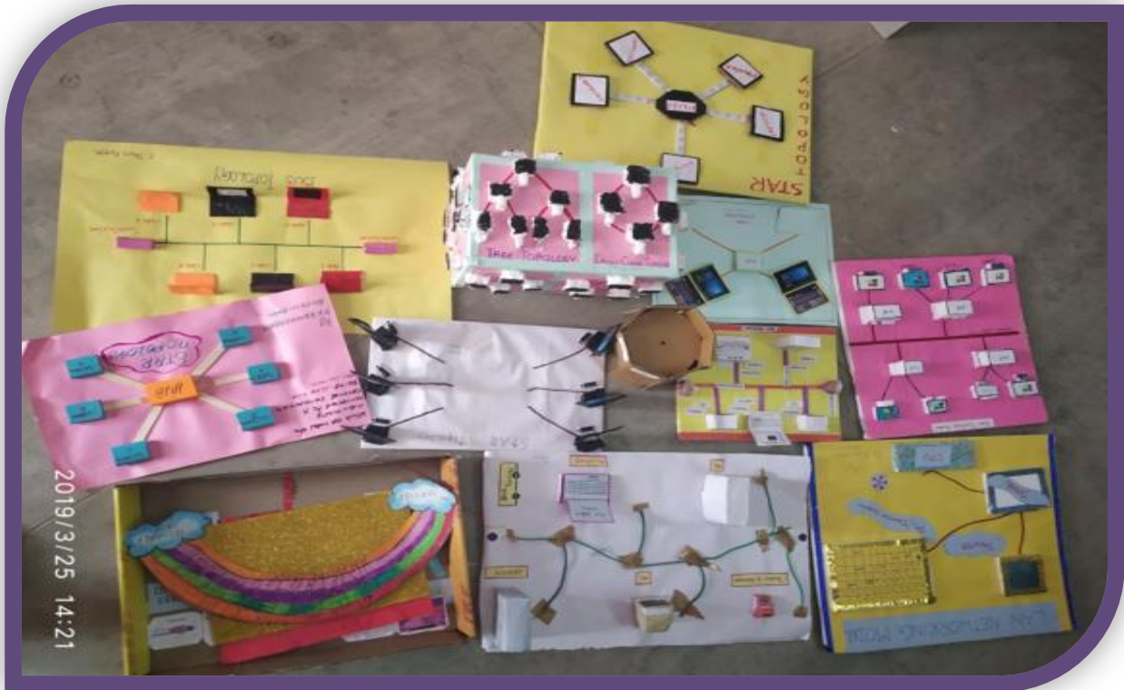
MODEL DESIGNED FOR CN