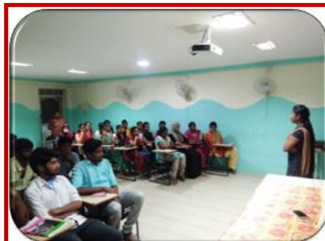
Guest lecture “ Networking Infrastructure and Opening in IT Industry for Fresher ” on 18.01.2019