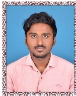
CHOCKALINGAM.S ENTERPRISE TOUCH