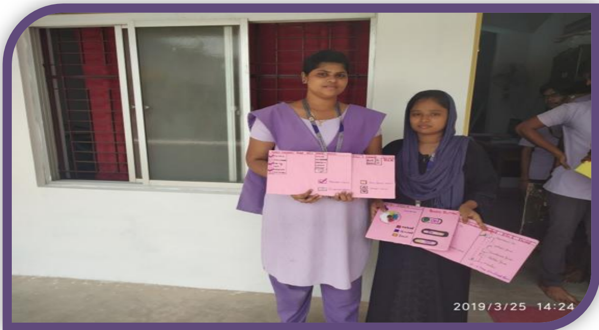
MODEL DESIGNED FOR HCI